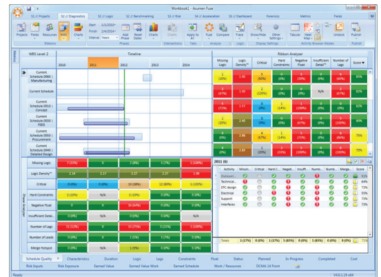
Acumen Fuse uses custom and pre-defined metrics to analyze schedule quality.

These advantages, coupled with Acumen’s demonstrated customer service and support, were all factors in Bombardier’s decision to move forward with Acumen Fuse.